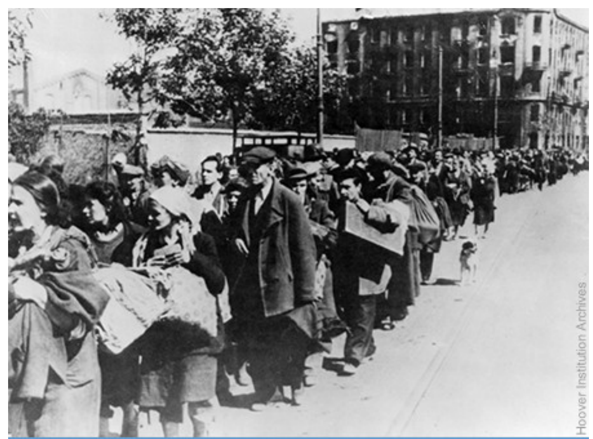
Inhabitants of Warsaw are marched to a camp south of the city following the collapse of the Warsaw Uprising, October 1944.

The war in Europe was going well for the Allies in late July 1944. After a successful invasion of Normandy, American and British forces were moving through northern France toward Paris. In Italy, they were already well past Rome. On the Eastern Front, the Germans had suffered a series of devastating losses and seemed to be withdrawing hastily to the west. Soviet tanks had reached the eastern suburbs of Warsaw. It appeared that Warsaw would be the first Allied capital to be liberated from the Nazis. Broadcasts from Moscow called on the Polish people to rise up against the Germans. The Battle for Warsaw was about to begin.